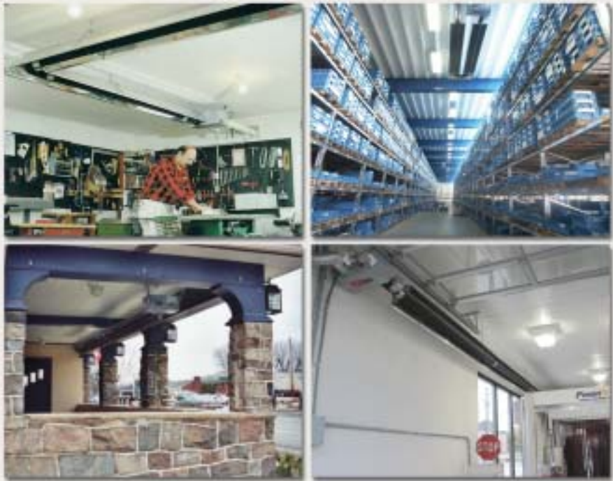
Specialty Heater Offering

The CX Series heater is specifically designed for applications that require a minimized clearance to combustible zone such as car washes, storage facilities, patios and much more. Utilizing the same control technology found in our higher-end, single-stage DX Series, the CX Series offers value, features and performance. The CX Series is the ideal solution for most low clearance heating applications.